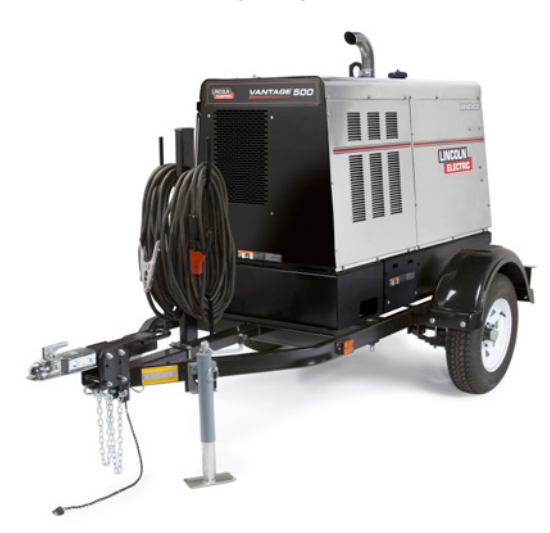
Ready-Pak Welding Package (Assembled)