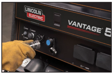
Automated Remote Control Capability

Automated Remote Control Capability – Output at welding terminals is automatically switched from the machine to remote mode when remote device is connected (standard 6-pin connector). For the CC-stick, downhill pipe and Touch Start TIG® modes, the machine output dial becomes a maximum current limit for more fine tuning with the remote control dial or Amptrol™.